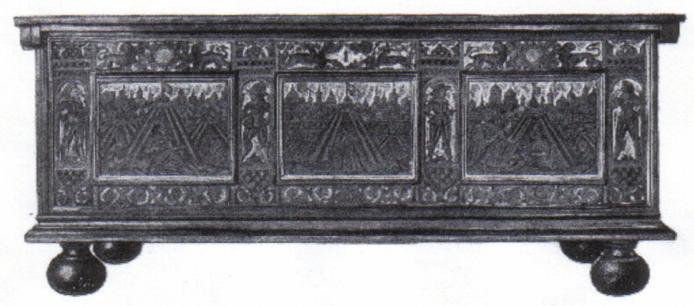
Fig. 2 Burnt wood chest - Cornell University

The decorations which have best withstood the ravages of time, and are the most chaste and refined, have been produced with the simplest means possible... the chisel, mallet, and marble; chisel and wood; modeling tool, clay and fire; sheet-metal and hammer. What could be more direct and simple than the red-hot iron and wood? In figure 2 below the Medieval Chest in Burnt Wood is an example of early 16<sup>th</sup> century English workmanship.