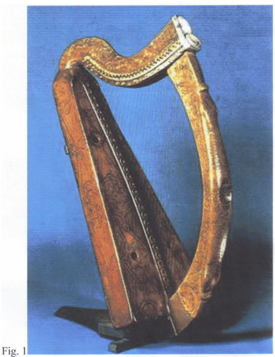
Trinity Harp – Trinity College